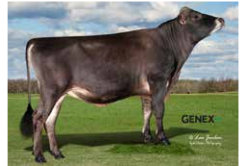
Tog GRAYSON PP

GRAYSON PP is a Jersey sire that will provide an opportunity for farmers looking for homozygous polled genetics. This Homozygous polled bull with a breed leading (no JX) also offers and an outcross pedigree, a GJPI of 149 and a JUL of +15.5.